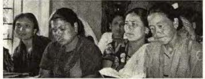
Patiswara Workshop, May 3, 2005